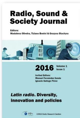
Figure 1: Vol. 1 N. 1 cover

Announced in 2015, the Radio, Sound & Society Journal (ISSN 2183-8798) was created to be an alternative scientific publication, on open access basis. The first issue on Latin Radio: Diversity, innovation and policies (Figure 1) was published in June with a selection of papers presented at the Radio Research Conference 2015 (held in Madrid).